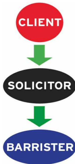
Figure 2. Traditional barrister–client relationship

The client (or lay client) seeks assistance from a solicitor who then instructs a barrister if particular kinds of expertise are required, especially advocacy. The primary relationship for the client is with the solicitor. The lack of directness for the client was often felt in court hearings where the barrister might be double-booked, owing to a trial and appeal conflicting for example. Clients were not permitted to reschedule their cases and therefore would have to hire another barrister at short notice. 6